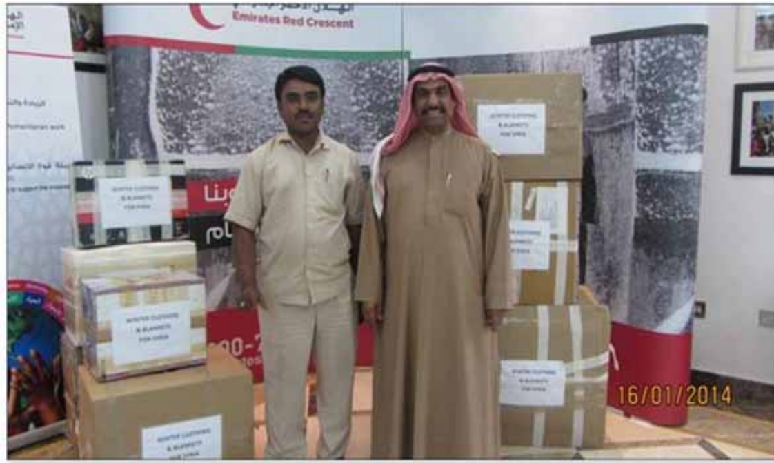
Winter Clothing & Blankets for Syrian refugees handed over to Red Crescent